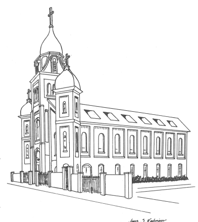
Saint Mary of the Immaculate Conception