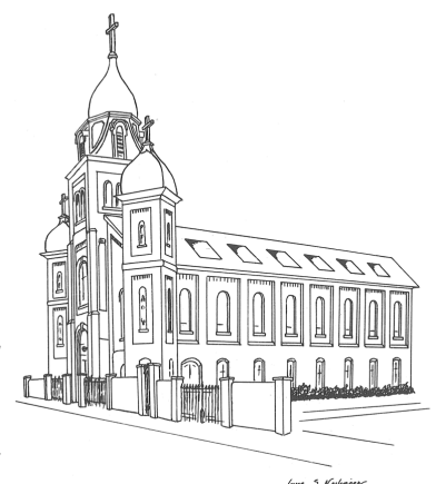
Saint Mary of the Immaculate Conception