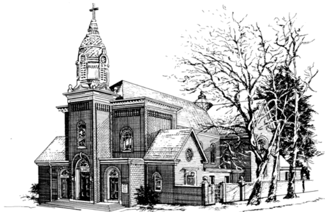
Cathedral of Saint Peter