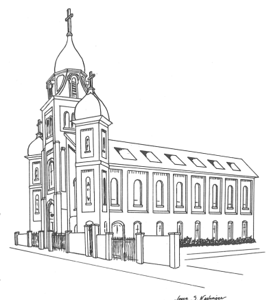
Saint Mary of the Immaculate Conception