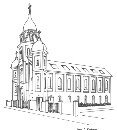
Saint Mary of the Immaculate Conception